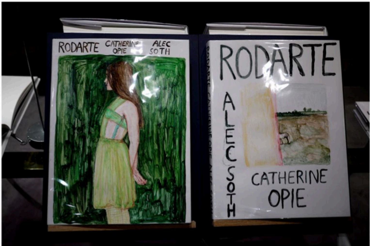
Rodarte collaborated with artist Rebekah Miles to create hand painted one of a kind book covers.