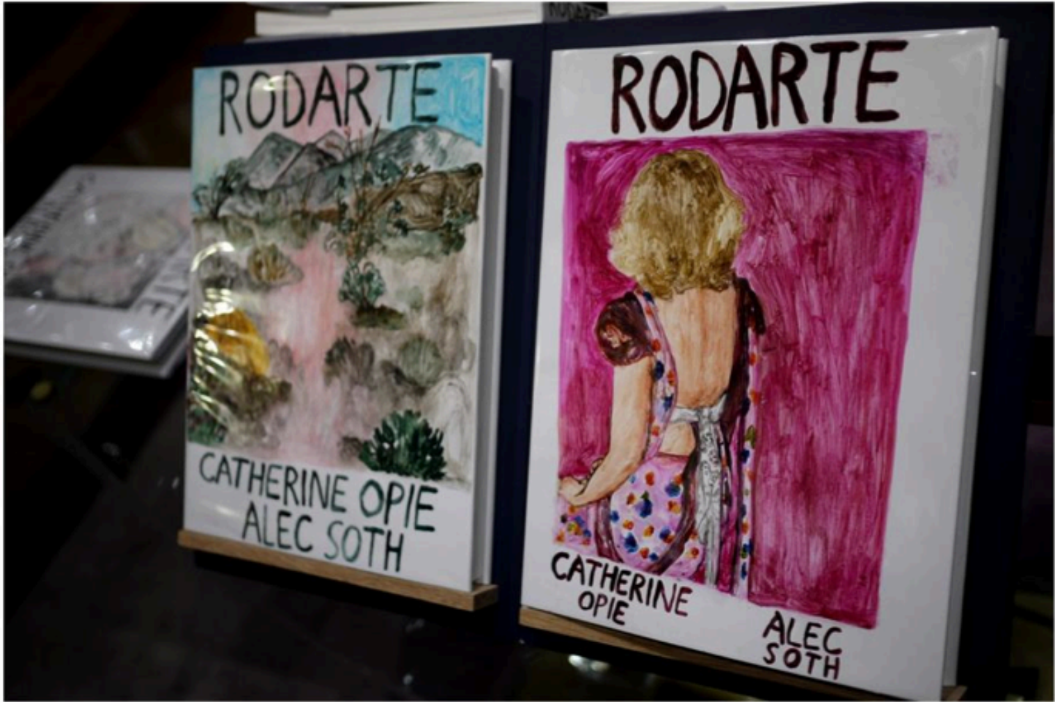
Rodarte collaborated with artist Rebekah Miles to create hand painted one of a kind book covers.