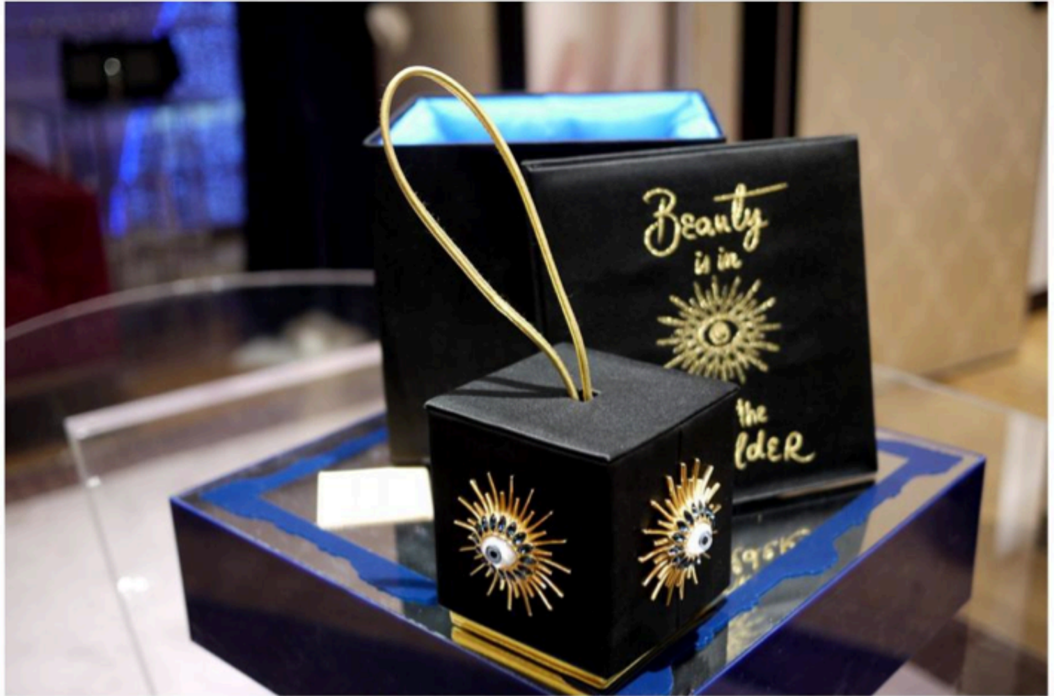
Lulu Guinness's bag 'Beauty is in the eye of the beholder'