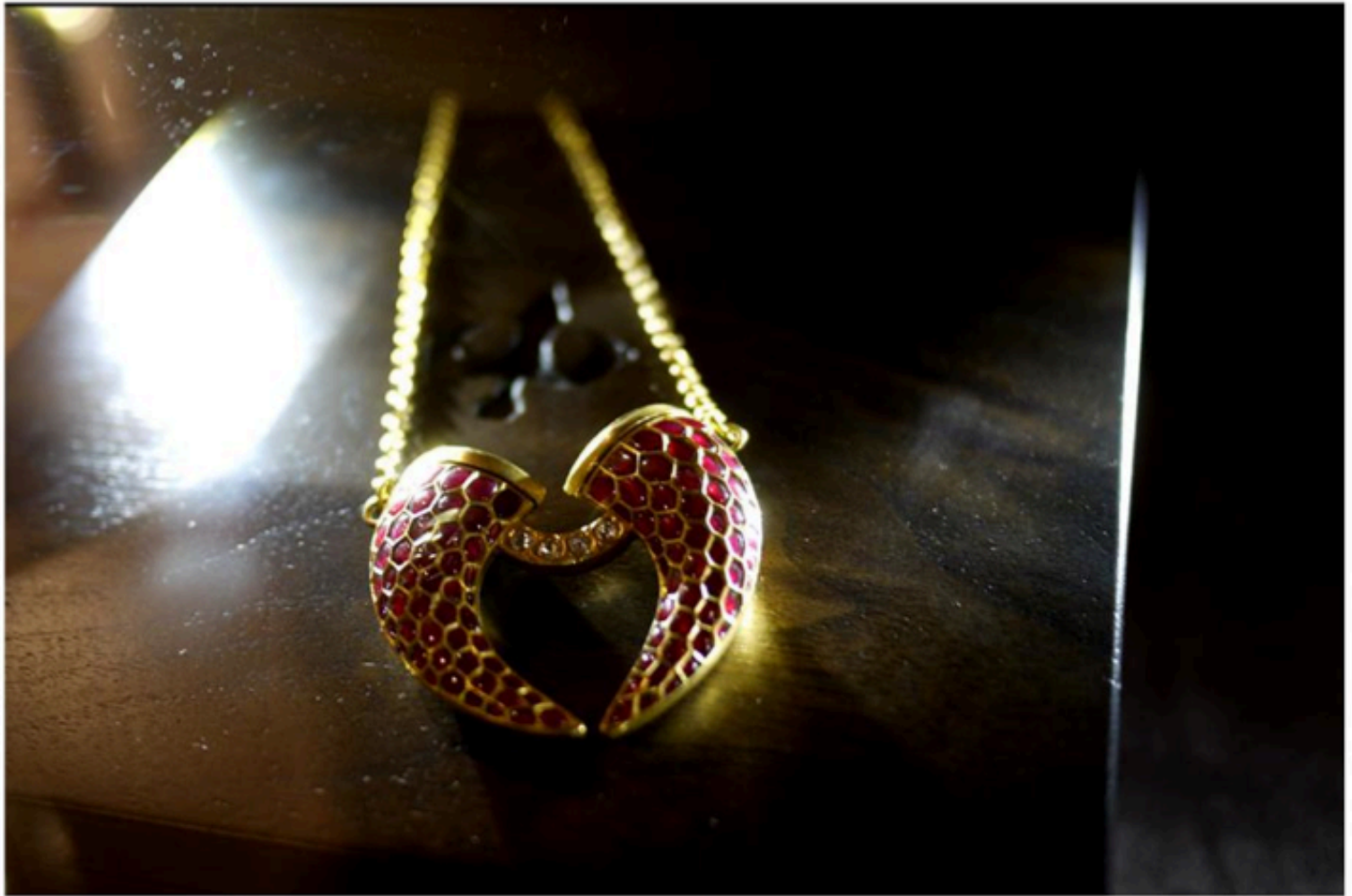
'Road of Excess' by House of Warr