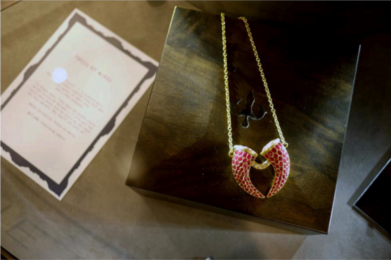
'Road of Excess' by House of Warr